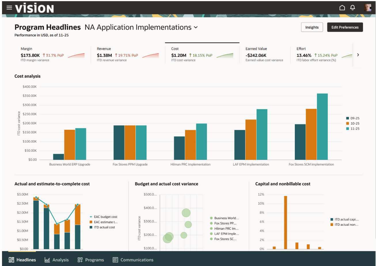
Figure 1. Monitor program performance and identify risk with program headlines and analysis.

Stakeholders are kept informed and engaged with regularly published communications on program health. Centralized and consistent program communications aid transparency and promote stakeholder collaboration, with conversations conducted from within the application for a timely exchange of insights and guidance. Program managers define communication reporting plans, controlling distribution frequency, publishing options, and content layout using easy-to-tailor templates that best fit the business needs of each program. Communication reports highlight trends over time and comprise working and published versions; the working version is automatically updated as performance data is collected for program monitoring and analysis.